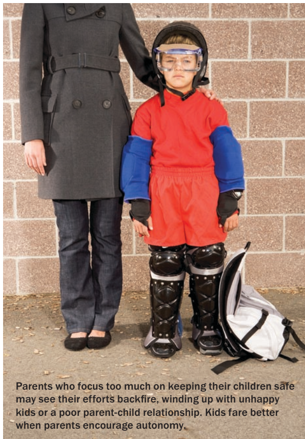
Parents who focus too much on keeping their children safe may see their efforts backfire, winding up with unhappy kids or a poor parent-child relationship. Kids fare better when parents encourage autonomy.

Tempering one's parenting with relevant scientific knowledge can truly have great benefits for one's family. It can reduce